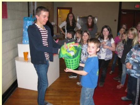
Interfaith Children's Fun Night